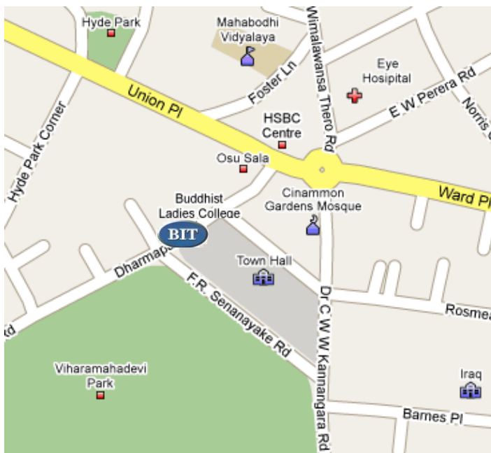
Figure 2: External Degrees Centre (EDC) of UCSC

EDC is located at 221/2A Dharmapala Mawatha, Colombo 07. Refer Figure 2 for the location of the BIT office.