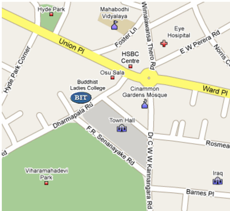
Figure 2: External Degrees Centre (EDC) of UCSC

EDC is located at 221/2A Dharmapala Mawatha, Colombo 07. Refer Figure 2 for the location of the BIT office.